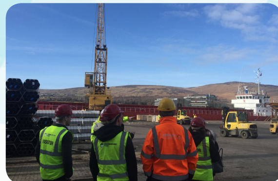
Attendees of our International Trade Practice Course during the site visit to Warrenpoint Port in March.