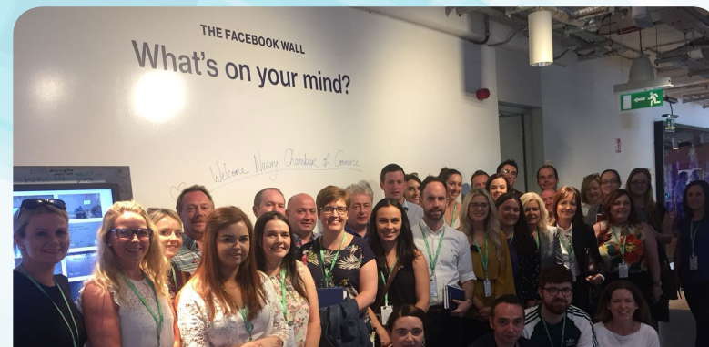
Representatives from over 40 members of Newry Chamber in attendance during our study visit to Facebook's European Headquarters in Dublin.

This year, our main company visit was to the European HQ of Facebook in Dublin. We were delighted to be joined by representatives from over 40 of our members who were provided with the unique opportunity to ask in-house experts with questions specifically related to their respective businesses.