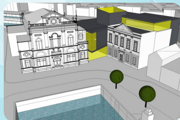
An artist's impression of what new theatre facilities would look like based around Newry Town Hall and the Sean Hollywood Arts Centre.