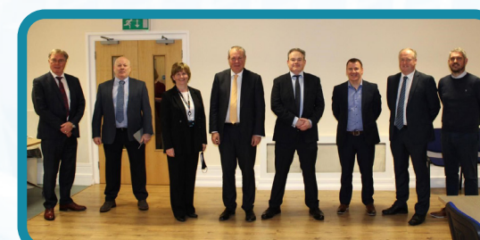
Meeting with NI Minister of State, Rt Hon. Conor Burns MP in Newry in October 2021.