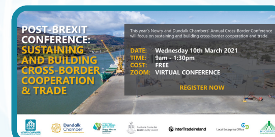
Our Annual Post-Brexit Cross-Border in partnership with Dundalk Chamber was held in March 2021.