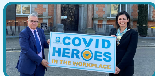
We also launched a campaign to celebrate COVID Heroes In The Workplace in April to profile those individuals who have helped to keep their businesses going through the last year.