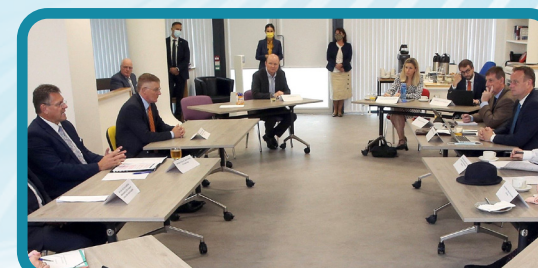
Meeting with European Commission Vice President, Maroš Šefčovič in Newry in September 2021.

In 2022, businesses will still face the twin challenges of Covid-19 and Brexit. The Chamber will ensure that the voice of local businesses is heard where it ultimately matters. We will continue to provide advice and support to businesses to help them navigate what will be another challenging year.