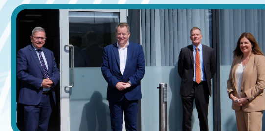
Meeting with Minister of State, Rt Hon. Lord Frost in Newry in September 2021.