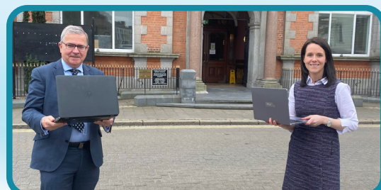
Newry Chamber helped to deliver 61 laptops to local schools for our Laptops For Schools Initiative to help local pupils with their home schooling during the lockdown.