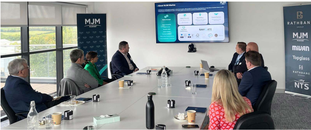
As part of the Cross-Border Trans-Atlantic Trade Mission in September, a delegation of Pittsburgh business and economic development leaders were given a tour of a number of successful member companies by Newry Chamber.

The Companies visited included The Exact Group, Pure Engineering and MJM Marine.