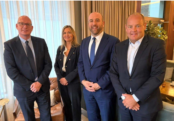
Secretary for the Department of Community & Economic Development for the Commonwealth of Pennsylvania in Dublin on September 26th as we held positive discussions on forging closer links between Newry and the State of Pennsylvania during Game Week of the Steelers' NFL clash at Croke Park.